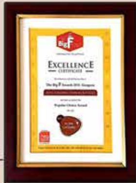
Big F Popular Choice Award