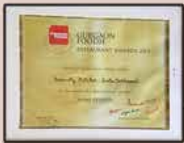
Gurgaon Foodie Award 2015 & 2016