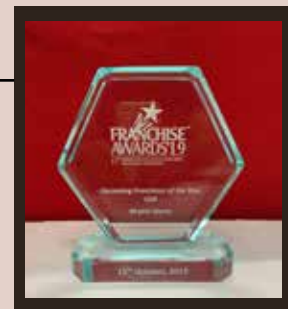
Upcoming Franchisor of the year 2019