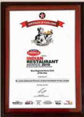
Indian Restaurant Award 2016